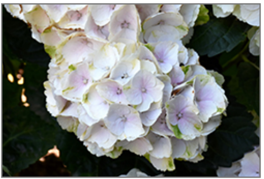
Seaside Serenade Cape Lookout Hydrangea flowers

This shrub does best in full sun to partial shade. You may want to keep it away from hot, dry locations that receive direct afternoon sun or which get reflected sunlight, such as against the south side of a white wall. It requires an evenly moist well-drained soil for optimal growth. It is not particular as to soil type, but has a definite preference for acidic soils. It is highly tolerant of urban pollution and will even thrive in inner city environments, and will benefit from being planted in a relatively sheltered location. Consider applying a thick mulch around the root zone in both summer and winter to conserve soil moisture and protect it in exposed locations or colder microclimates. This is a selected variety of a species not originally from North America.