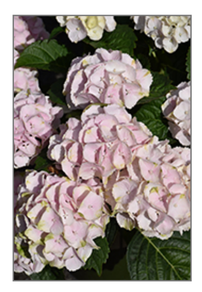
Seaside Serenade Cape Lookout Hydrangea flowers

This shrub will require occasional maintenance and upkeep, and should only be pruned after flowering to avoid removing any of the current season's flowers. It has no significant negative characteristics.