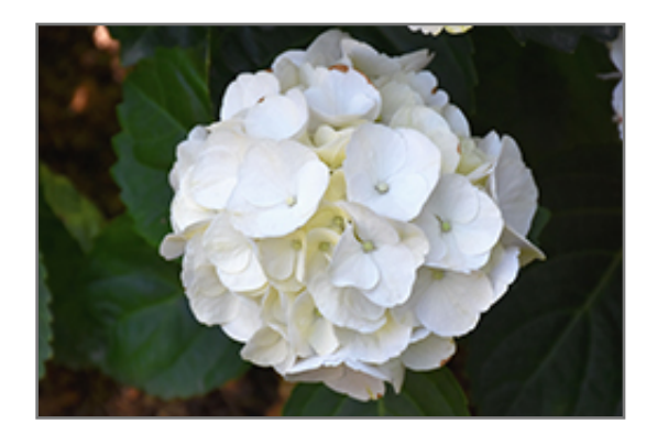
Seaside Serenade Cape Lookout Hydrangea flowers