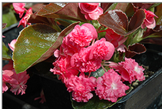
Doublet Rose Begonia flowers