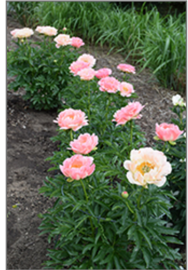
Coral Sunset Peony in bloom

This plant does best in full sun to partial shade. It does best in average to evenly moist conditions, but will not tolerate standing water. It is not particular as to soil pH, but grows best in rich soils. It is somewhat tolerant of urban pollution. This particular variety is an interspecific hybrid. It can be propagated by division; however, as a cultivated variety, be aware that it may be subject to certain restrictions or prohibitions on propagation.