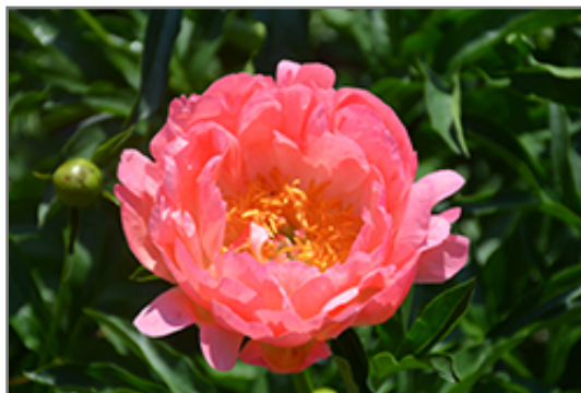
Coral Sunset Peony flowers