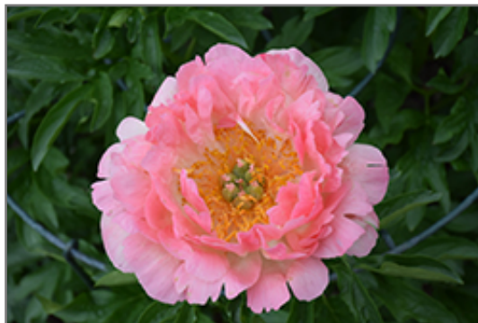
Coral Sunset Peony flowers (faded)