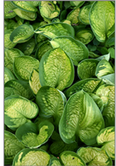
Rainforest Sunrise Hosta foliage

Rainforest Sunrise Hosta is recommended for the following landscape applications;