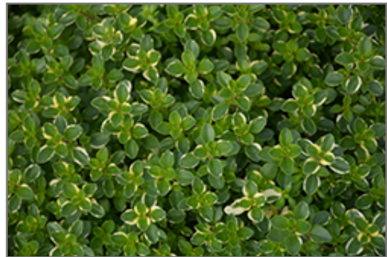
Variegated Broadleaf Thyme foliage