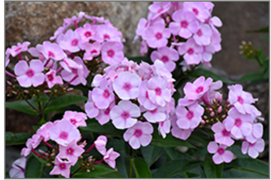
Cotton Candy Garden Phlox flowers