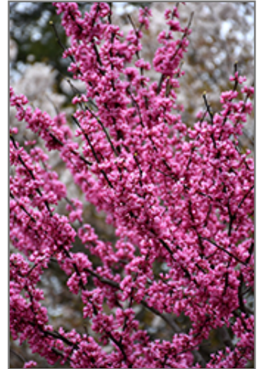
Appalachian Red Redbud flowers