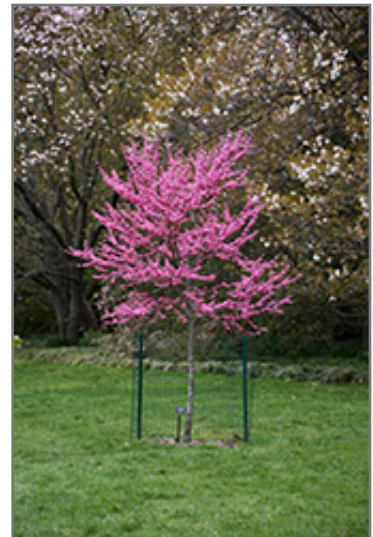
Appalachian Red Redbud in bloom