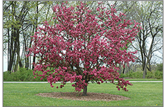
Purple Prince Flowering Crab in bloom

This tree will require occasional maintenance and upkeep, and is best pruned in late winter once the threat of extreme cold has passed. It is a good choice for attracting birds to your yard. It has no significant negative characteristics.