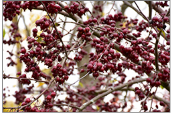
Purple Prince Flowering Crab fruit

This tree should only be grown in full sunlight. It prefers to grow in average to moist conditions, and shouldn't be allowed to dry out. It is not particular as to soil type or pH. It is highly tolerant of urban pollution and will even thrive in inner city environments. This particular variety is an interspecific hybrid.