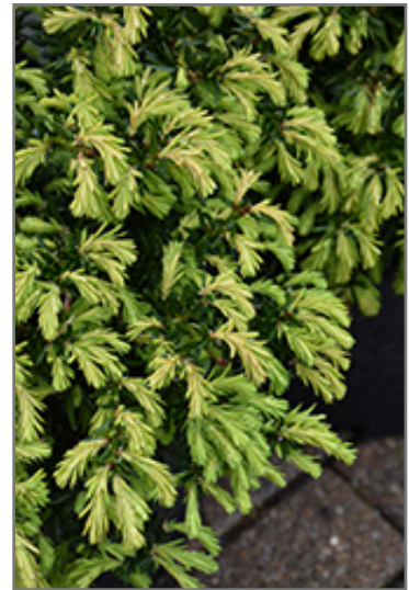
Everlow Yew foliage