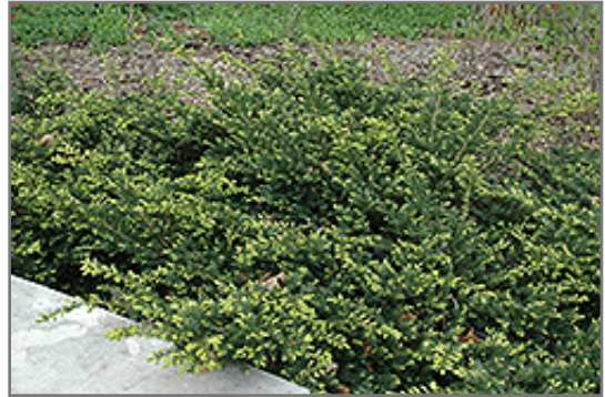
Everlow Yew