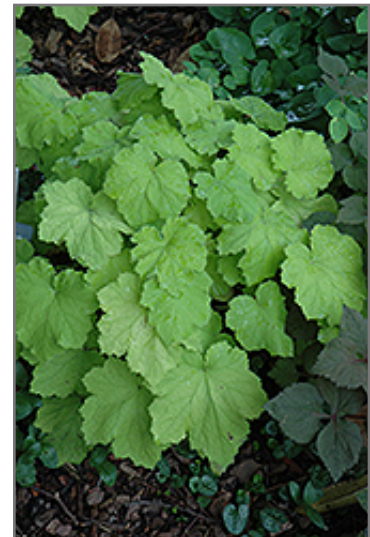
Pistache Coral Bells