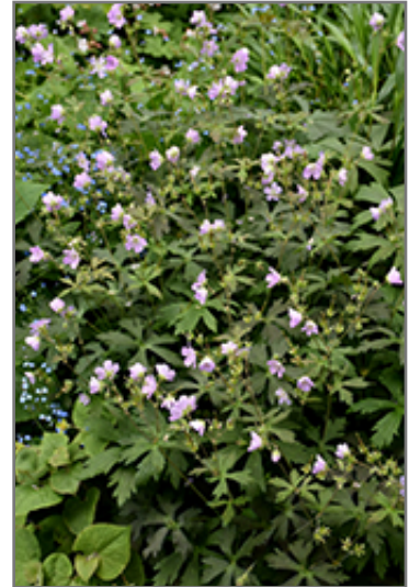
Espresso Cranesbill in bloom

Espresso Cranesbill is a fine choice for the garden, but it is also a good selection for planting in outdoor pots and containers. It is often used as a 'filler' in the 'spiller-thriller-filler' container combination, providing a mass of flowers and foliage against which the thriller plants stand out. Note that when growing plants in outdoor containers and baskets, they may require more frequent waterings than they would in the yard or garden.