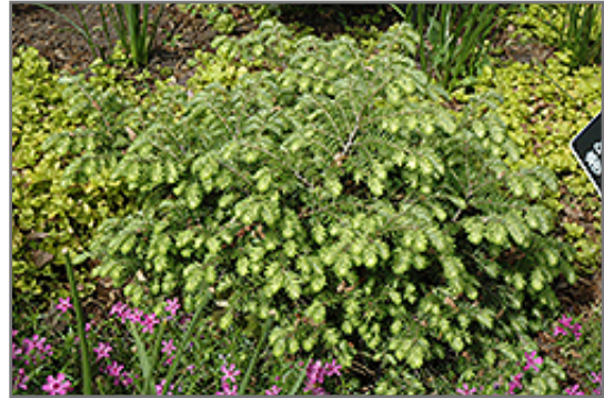
Moon Frost Hemlock

Moon Frost Hemlock is recommended for the following landscape applications;