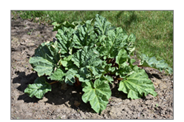
Chipman Red Rhubarb

Chipman Red Rhubarb features bold spikes of white flowers rising above the foliage from early to mid summer. Its enormous crinkled round leaves remain green in color throughout the season. The red stems are very colorful and add to the overall interest of the plant.