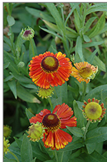
Sahin's Early Flowerer Sneezeweed flowers

This plant will require occasional maintenance and upkeep, and should be cut back in late fall in preparation for winter. It is a good choice for attracting butterflies to your yard, but is not particularly attractive to deer who tend to leave it alone in favor of tastier treats. Gardeners should be aware of the following characteristic(s) that may warrant special consideration;