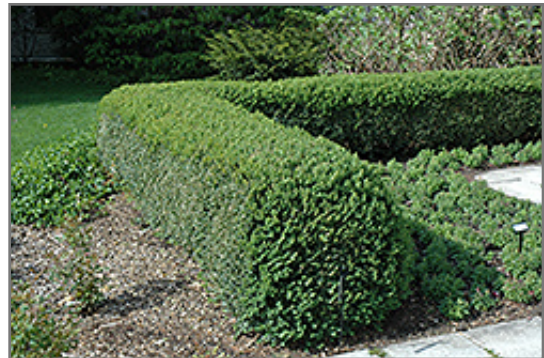
Northern Charm Boxwood