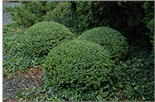
Northern Charm Boxwood