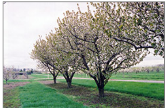
Sweet Cherry in bloom