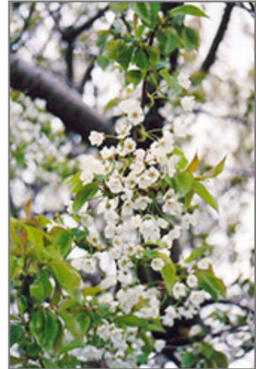
Sweet Cherry flowers

Sweet Cherry is covered in stunning clusters of fragrant white flowers hanging below the branches in early spring before the leaves. It has dark green deciduous foliage. The pointy leaves turn yellow in fall. The fruits are showy red drupes carried in abundance in mid summer. The fruit can be messy if allowed to drop on the lawn or walkways, and may require occasional clean-up. The smooth dark red bark adds an interesting dimension to the landscape.