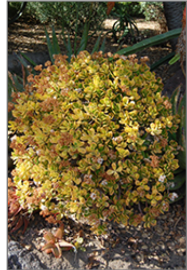
Hummel's Sunset Golden Jade Plant in bloom

Hummel's Sunset Golden Jade Plant is a multi-stemmed evergreen shrub with an upright spreading habit of growth. Its average texture blends into the landscape, but can be balanced by one or two finer or coarser trees or shrubs for an effective composition.