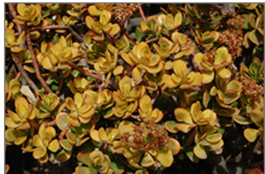
Hummel's Sunset Golden Jade Plant foliage