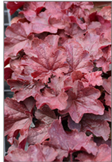
Northern Exposure Red Coral Bells foliage

Northern Exposure Red Coral Bells is recommended for the following landscape applications;