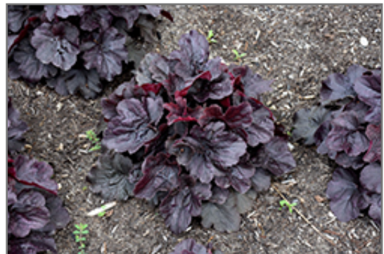
Northern Exposure Black Coral Bells