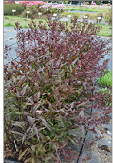
Pocahontas Beard Tongue

This is a relatively low maintenance plant, and is best cleaned up in early spring before it resumes active growth for the season. It is a good choice for attracting butterflies to your yard. It has no significant negative characteristics.