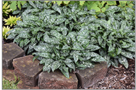
Twinkle Toes Lungwort

Twinkle Toes Lungwort is a fine choice for the garden, but it is also a good selection for planting in outdoor pots and containers. It is often used as a 'filler' in the 'spiller-thriller-filler' container combination, providing a mass of flowers and foliage against which the thriller plants stand out. Note that when growing plants in outdoor containers and baskets, they may require more frequent waterings than they would in the yard or garden.