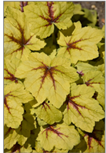
Catching Fire Foamy Bells foliage