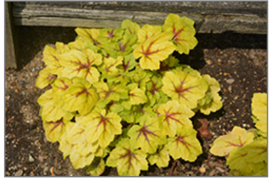
Catching Fire Foamy Bells

This is a relatively low maintenance plant, and should be cut back in late fall in preparation for winter. It is a good choice for attracting hummingbirds to your yard. It has no significant negative characteristics.