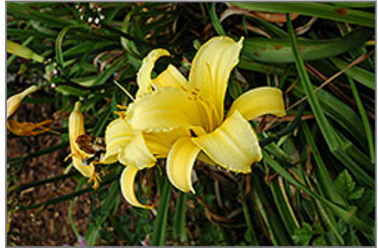
Mary Todd Daylily flowers