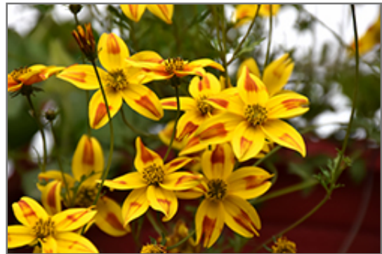
Beedance Red Stripe Bidens flowers