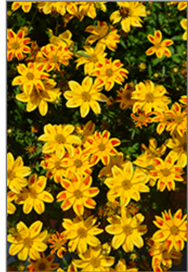
Beedance Red Stripe Bidens flowers

Beedance Red Stripe Bidens is recommended for the following landscape applications;