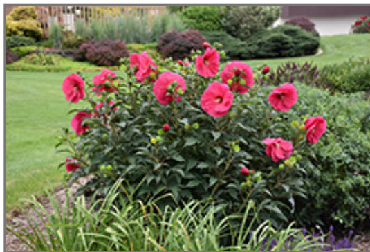
Summer In Paradise Hibiscus in bloom