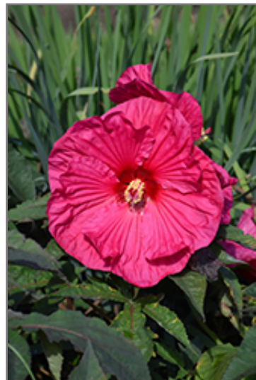
Summer In Paradise Hibiscus flowers