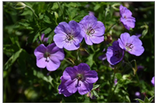
Azure Rush Cranesbill flowers