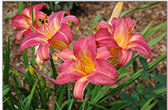
Cherry Cheeks Daylily flowers