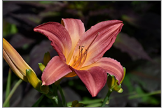
Cherry Cheeks Daylily flowers

Cherry Cheeks Daylily is recommended for the following landscape applications;