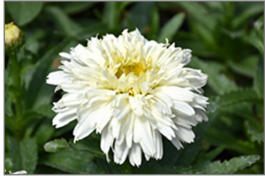
Macaroon Shasta Daisy flowers