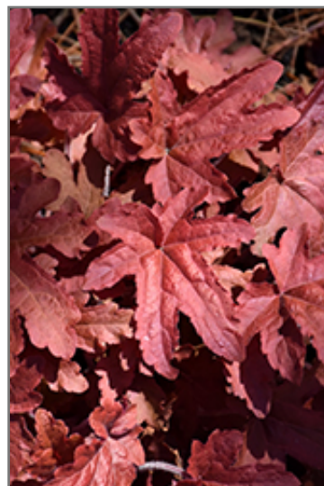
Fun and Games Red Rover Foamy Bells foliage

This is a relatively low maintenance plant, and should be cut back in late fall in preparation for winter. It is a good choice for attracting hummingbirds to your yard. It has no significant negative characteristics.