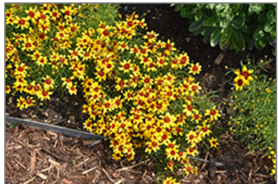
Sizzle And Spice Curry Up Tickseed in bloom