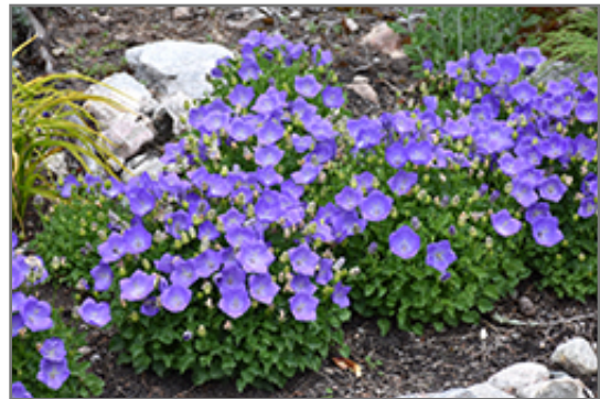
Rapido Blue Bellflower in bloom