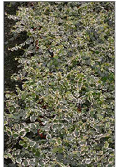
Variegated Creeping Fig in full