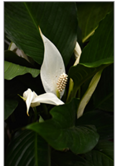
Peace Lily flowers