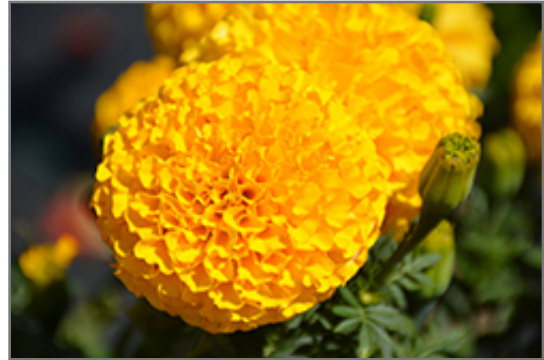
Taishan Gold Marigold flowers

Taishan Gold Marigold is recommended for the following landscape applications;