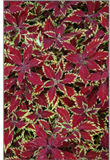
ColorBlaze Royale Apple Brandy Coleus foliage