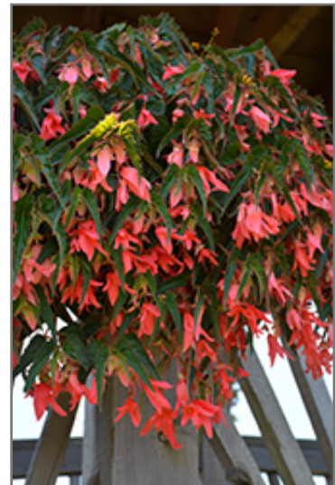
San Francisco Begonia in bloom