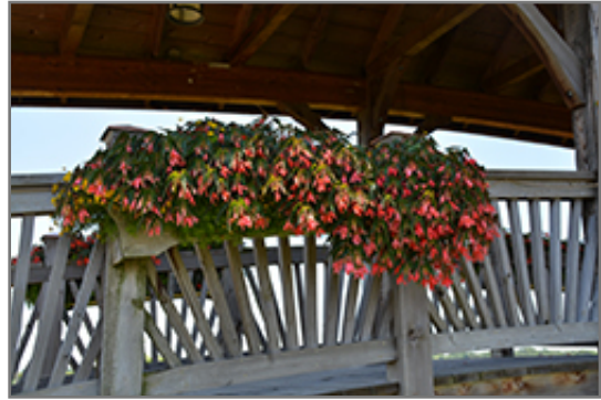
San Francisco Begonia in bloom

San Francisco Begonia is a fine choice for the garden, but it is also a good selection for planting in outdoor containers and hanging baskets. Because of its trailing habit of growth, it is ideally suited for use as a 'spiller' in the 'spiller-thriller-filler' container combination; plant it near the edges where it can spill gracefully over the pot. Note that when growing plants in outdoor containers and baskets, they may require more frequent waterings than they would in the yard or garden.