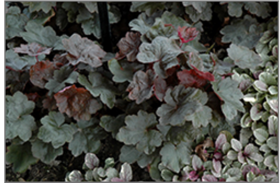
Carnival Black Olive Coral Bells

Carnival Black Olive Coral Bells is recommended for the following landscape applications;