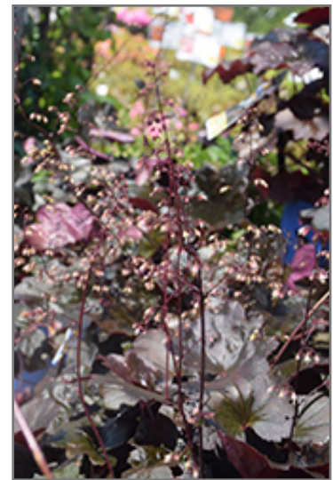
Carnival Black Olive Coral Bells flowers