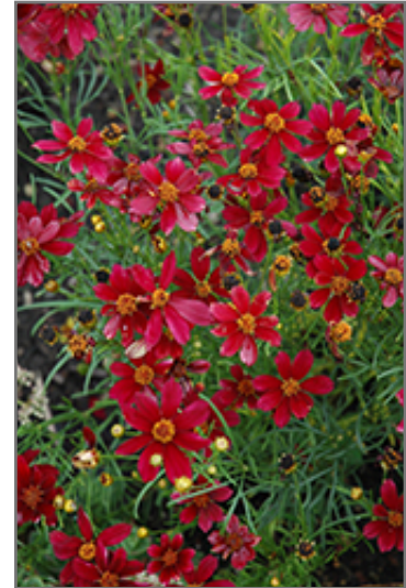
Red Satin Tickseed flowers