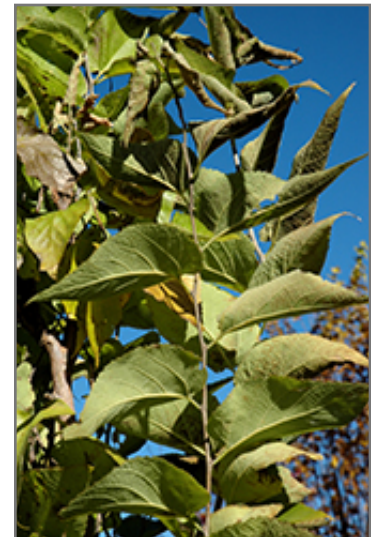
Prairie Sentinel Hackberry foliage