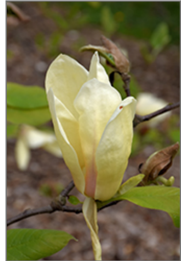
Yellow Lantern Magnolia flowers