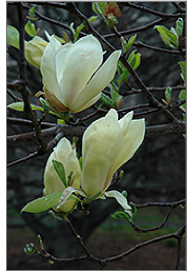
Yellow Lantern Magnolia flowers

This tree does best in full sun to partial shade. It requires an evenly moist well-drained soil for optimal growth, but will die in standing water. It is not particular as to soil type, but has a definite preference for acidic soils. It is quite intolerant of urban pollution, therefore inner city or urban streetside plantings are best avoided. Consider applying a thick mulch around the root zone in winter to protect it in exposed locations or colder microclimates. This particular variety is an interspecific hybrid.