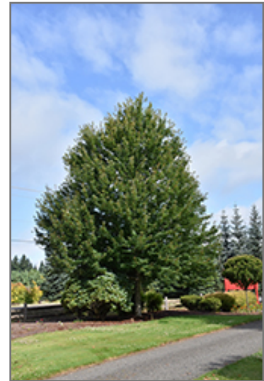
Redpointe Red Maple