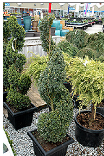
Green Mountain Boxwood (spiral form)

Green Mountain Boxwood (spiral form) will grow to be about 6 feet tall at maturity, with a spread of 14 inches. It has a low canopy, and is suitable for planting under power lines. It grows at a slow rate, and under ideal conditions can be expected to live for approximately 30 years.