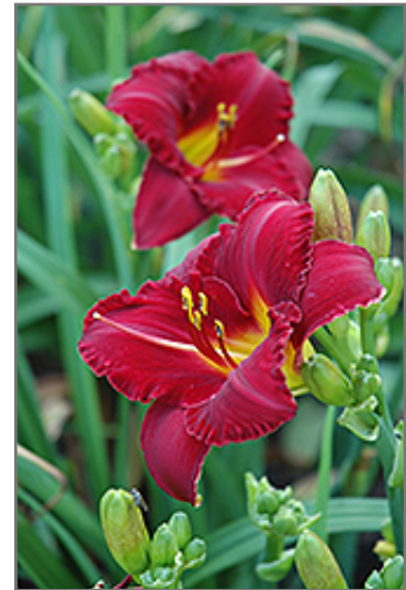
Pygmy Prince Daylily flowers