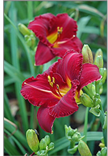
Pygmy Prince Daylily flowers