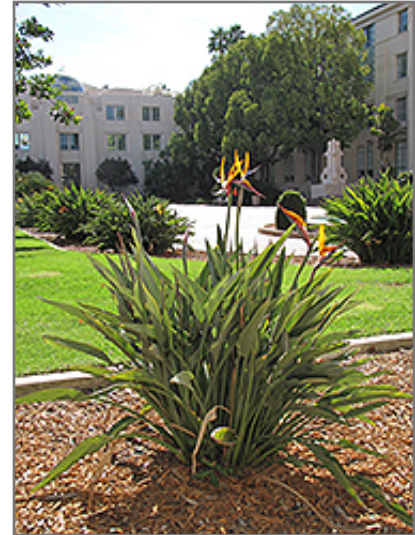
Orange Bird Of Paradise in bloom

Orange Bird Of Paradise is a fine choice for the garden, but it is also a good selection for planting in outdoor pots and containers. With its upright habit of growth, it is best suited for use as a 'thriller' in the 'spiller-thriller-filler' container combination; plant it near the center of the pot, surrounded by smaller plants and those that spill over the edges. It is even sizeable enough that it can be grown alone in a suitable container. Note that when growing plants in outdoor containers and baskets, they may require more frequent waterings than they would in the yard or garden. Be aware that in our climate, this plant may be too tender to survive the winter if left outdoors in a container. Contact our experts for more information on how to protect it over the winter months.