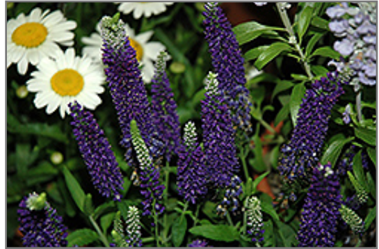
Vernique Dark Blue Speedwell flowers