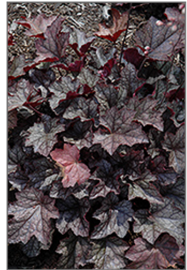
Carnival Plum Crazy Coral Bells foliage