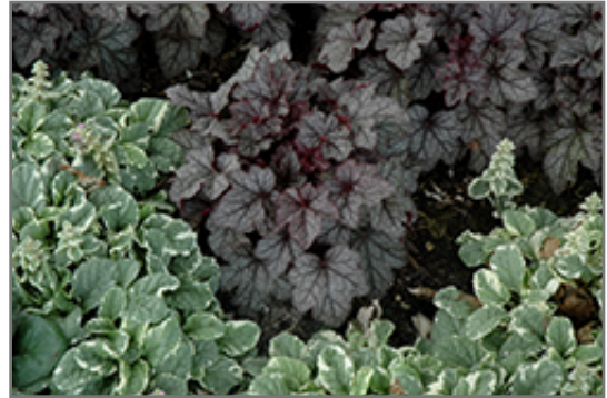
Carnival Plum Crazy Coral Bells

Carnival Plum Crazy Coral Bells is recommended for the following landscape applications;