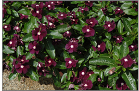
Jams 'N Jellies Blackberry Vinca flowers

Jams 'N Jellies Blackberry Vinca is recommended for the following landscape applications;