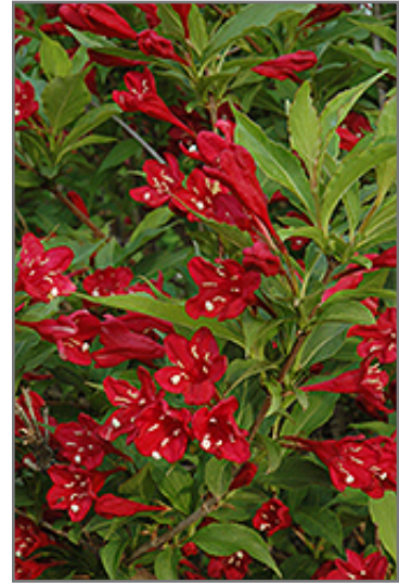
Red Prince Weigela flowers