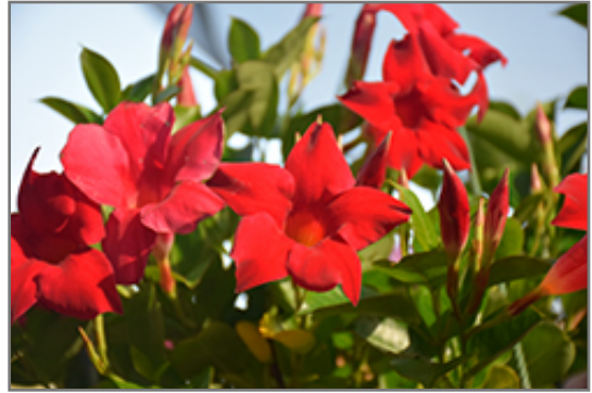
Sun Parasol Crimson Mandevilla flowers

This plant is native to the tropics and prefers growing in moist environments with evenly warm conditions all year round. In our climate, it is usually grown as an outdoor annual in the garden or in a container. If you want it to survive the winter, it can be brought in to the house and provided with special care, and then returned to the garden the following season. In its preferred tropical habitat, it can grow to be around 10 feet tall at maturity, with a spread of 24 inches. However, when grown as an annual or when overwintered indoors, it can be expected to perform differently, and its exact height and spread will depend on many factors; you may wish to consult with our experts as to how it might perform in your specific application and growing conditions.