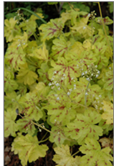
Solar Power Foamy Bells flowers